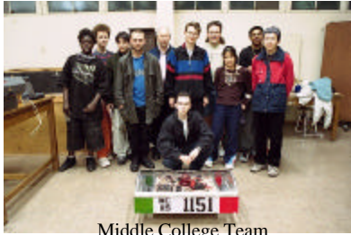
Middle College Team