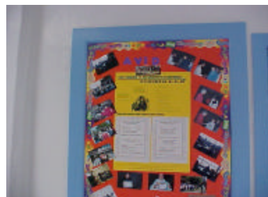
Eye catching bulletin board at MIT